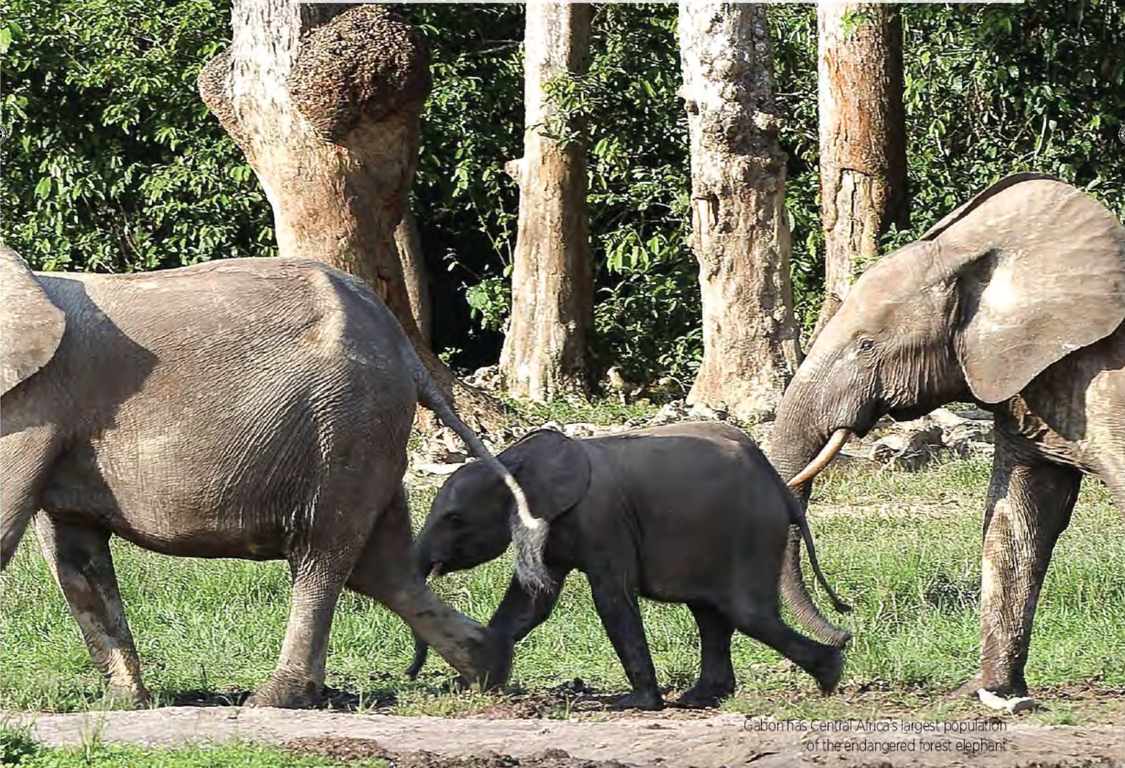
Gabon has Central Africa's largest population of the endangered forest elephant

The nation has always been proud of its biodiversity and committed to conservation. It comes as little surprise then that ecotourism is integral to the Emerging Gabon economic diversification strategy. With the world's second largest rainforest, the country holds some of the biggest populations of forest elephants, western lowland gorillas and nesting leatherback turtles. This alone puts it in prime position to become a global player in ecotourism. According to the immigration department, between 2010 and 2015, Gabon welcomed an average of 180,000 to 200,000 visitors annually. While majority came for