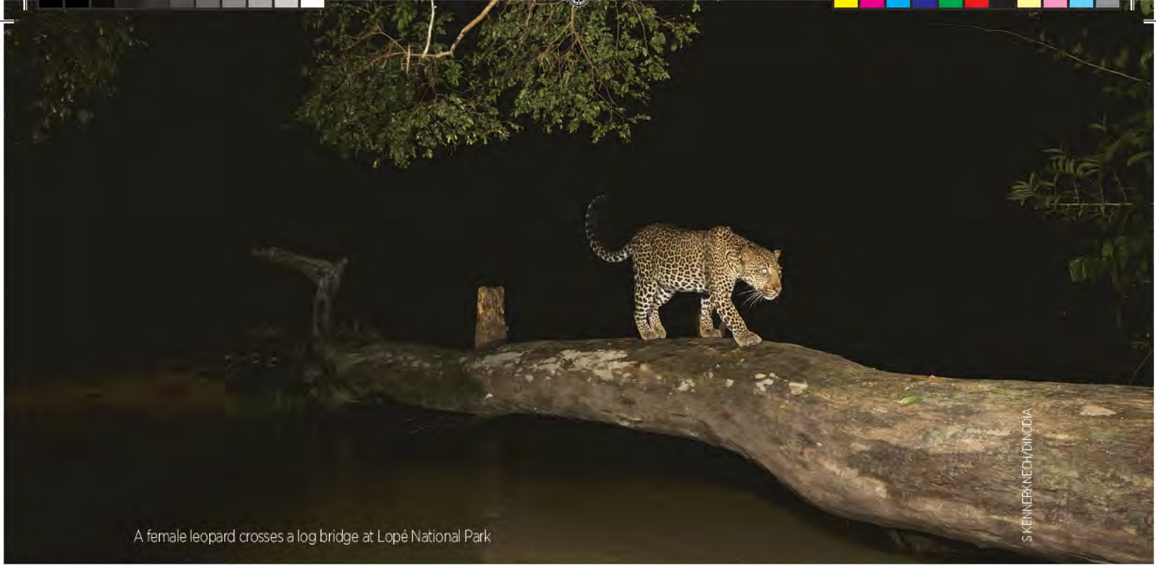
A female leopard crosses a log bridge at Lopé National Park