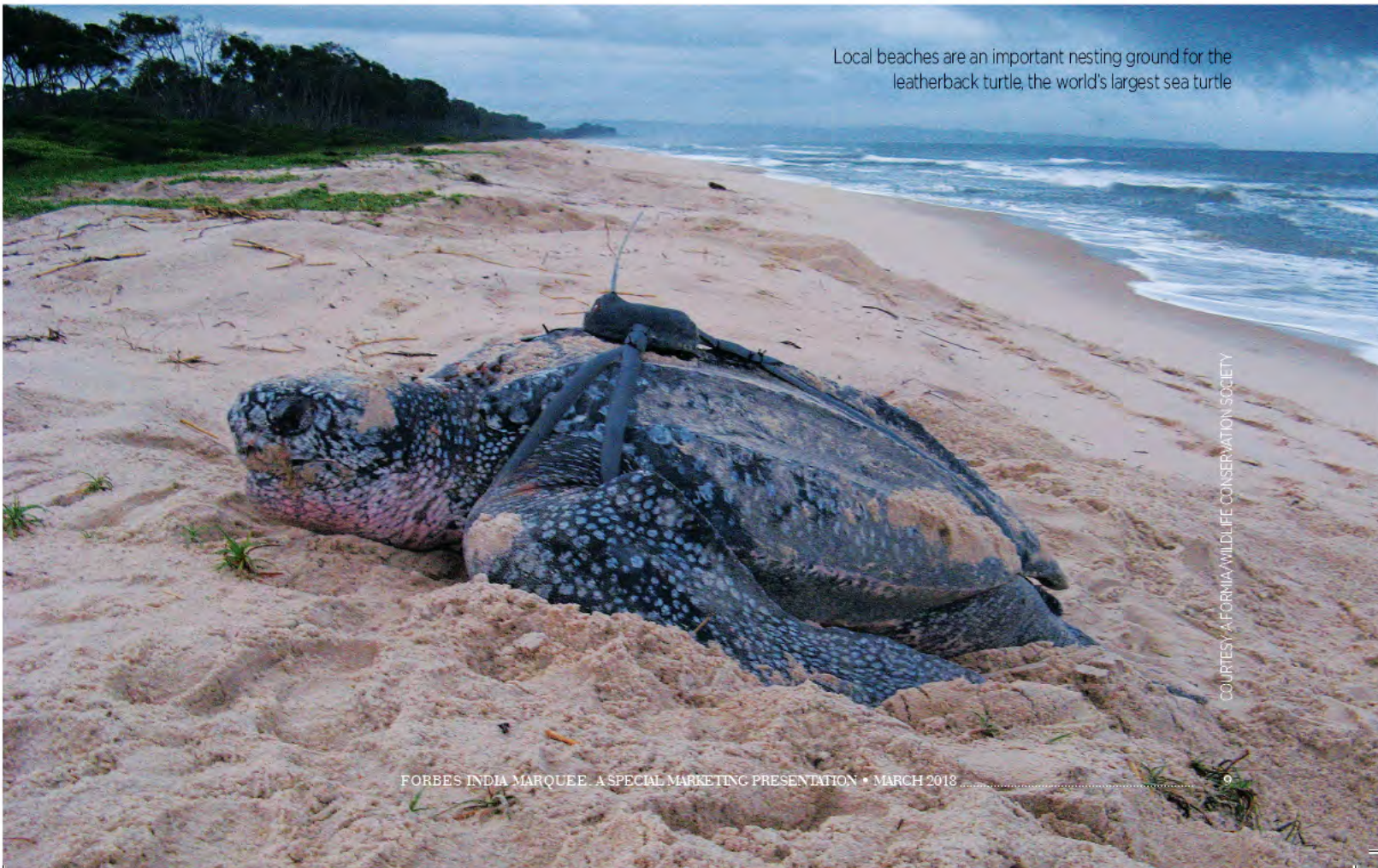
Local beaches are an important nesting ground for the leatherback turtle, the world's largest sea turtle

The marine protected area will be managed by Gabon's the newly established Nature Preservation Agency. ♦