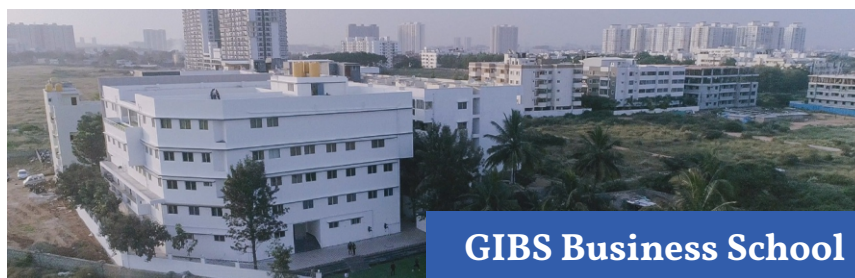
GIBS Business School

GIBS is known to have a learning environment laced with fun and extracurricular activities that makes the teaching-learning process extremely